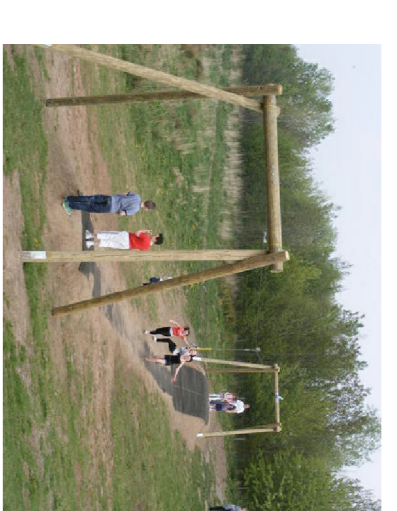
5. Double Cableway - FHS (Proludic) Height 3.2m