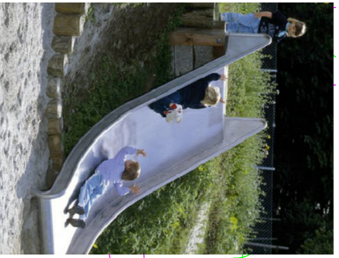
4. Small Children Slide - Timberplay