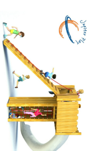
6. Jupiter 'Wall Tower Trier' - Bespoke. Platform height 2.95m