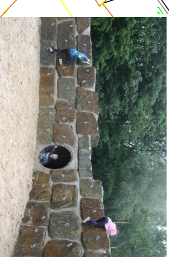
9. Traverse wall - Bespoke Ground level to 2m high