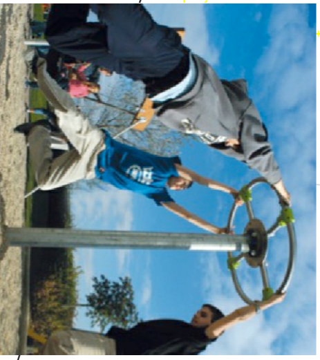
2. Roll Up - Proludic Height 1.73m