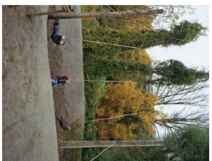
1. Swing Rope - Timberplay Max height for top of post 5.8m