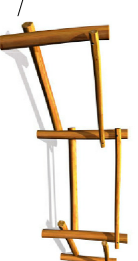
8. Balance trail - Proludic 1.6m height