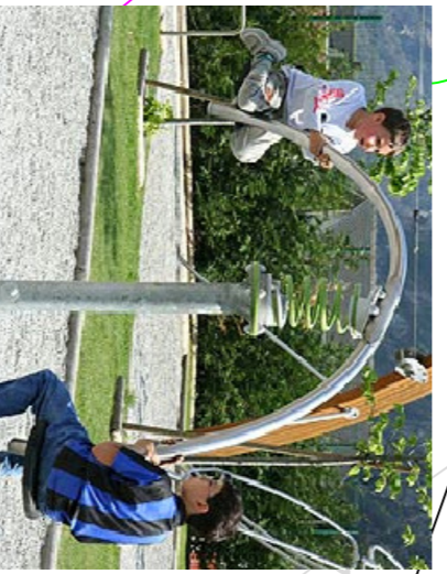
3. Hip Hop - Proludic Height 1.57m